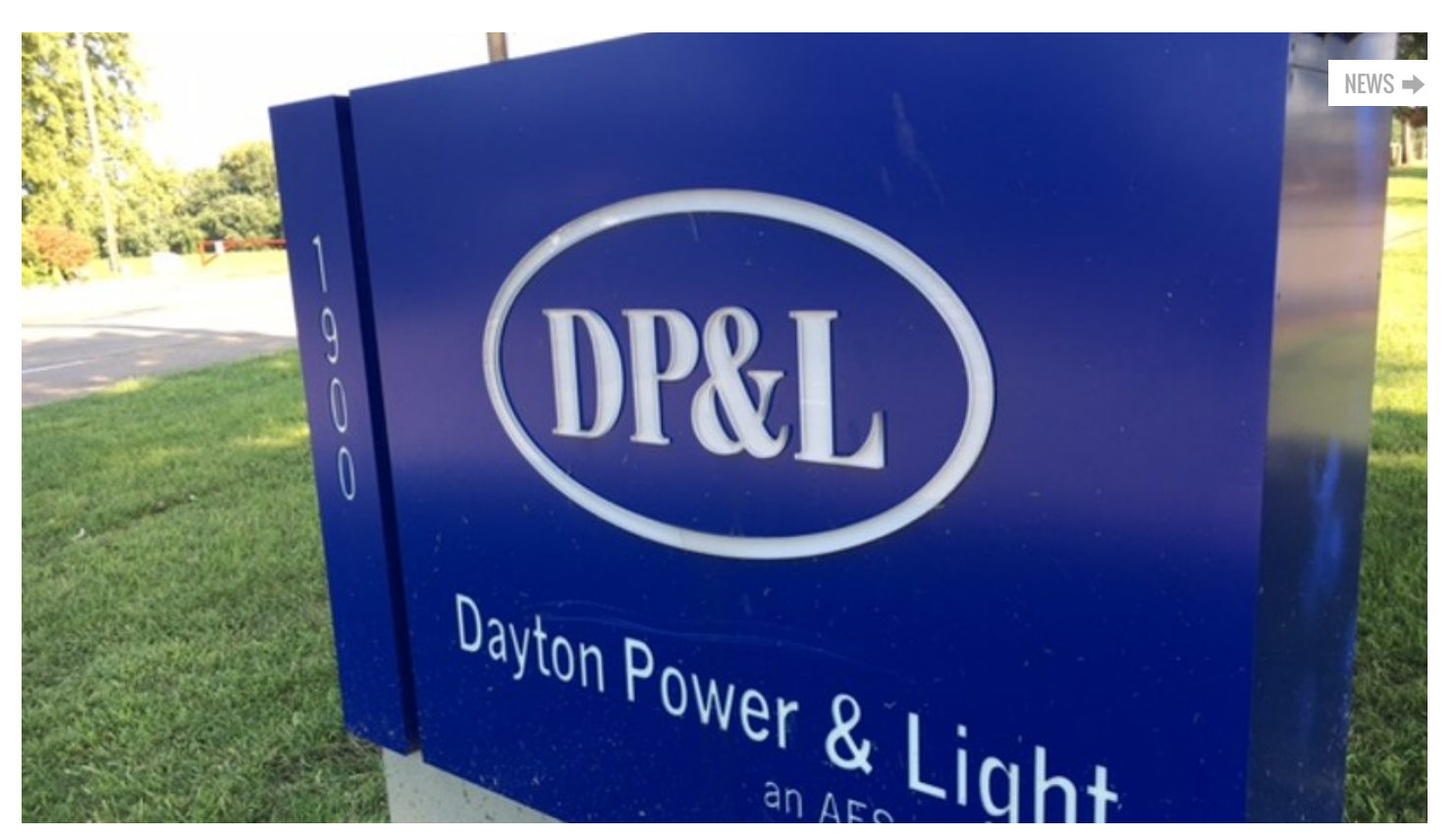
Dayton Power and Light is lobbying state legislators to amend existing law that would allow the Public Utilities Commission of Ohio to raise electric rates if a utility's financial integrity is at stake.